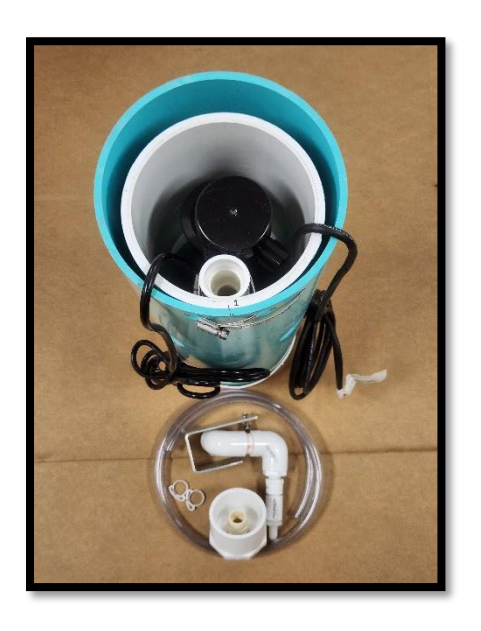
IC25LH Filtered Pump Vault and Assembly Parts

The LC25LH Filtered Pump Vault consists of a pump, check valve, discharge piping, hose, flow orifice, support bracket, level control switch, filter screen housing and a protective outer vault.