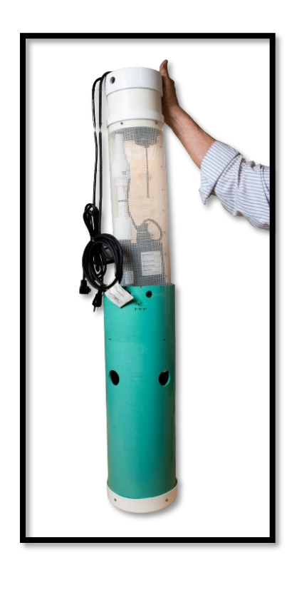
The Pump Assembly